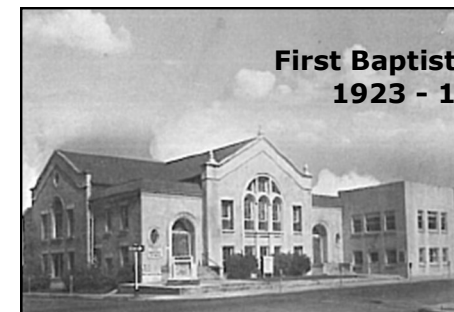
First Baptist Church 1923 - 1963