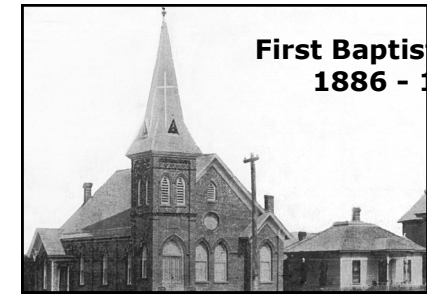
First Baptist Church 1886 - 1905