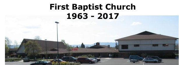
First Baptist Church 1963 - 2017